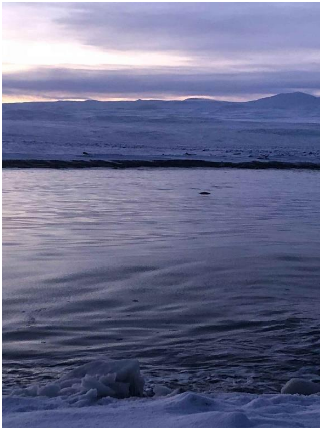
Dead walrus just shot in the ocean.