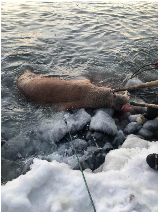
The walrus weighed about 1000 pounds and will feed lots of people! The big ones weigh around 2000 pounds.