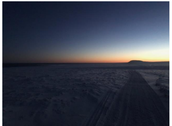
Savoonga sunrise at 12 noon.